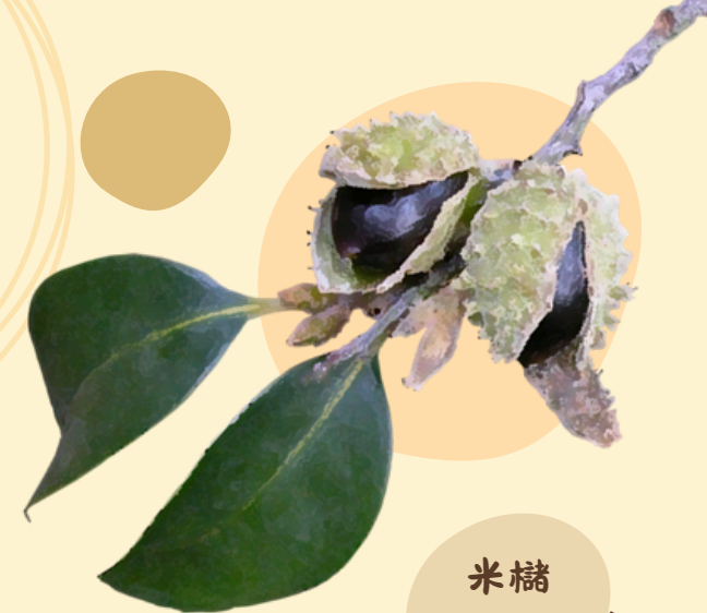
米櫨 Castanopsis carlesii