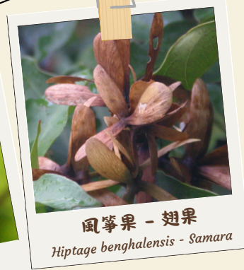
風箏果 - 翅果 Hiptage benghalensis - Samara