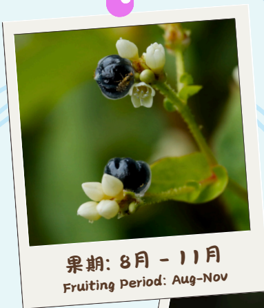
果期: 8月 - 11月 Fruiting Period: Aug-Nov