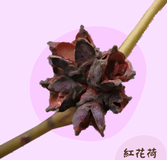
紅花荷 Rhodoleia championii