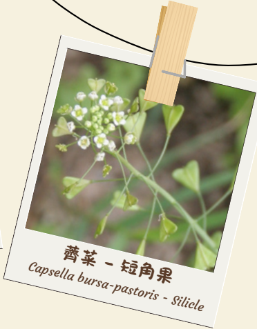
薺菜 - 短角果 Capsella bursa-pastoris - Silicle