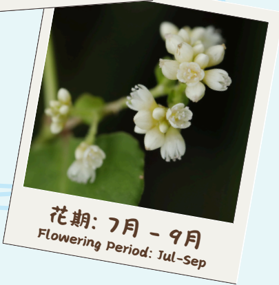
花期: 7月 - 9月 Flowering Period: Jul-Sep