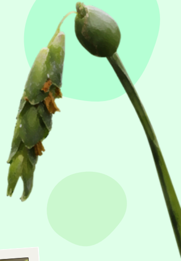
薏苡 Coix lacryma-jobi