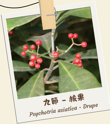
九節 - 核果 Psychotria asiatica - Drupe