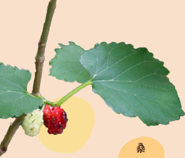
桑 Morus alba