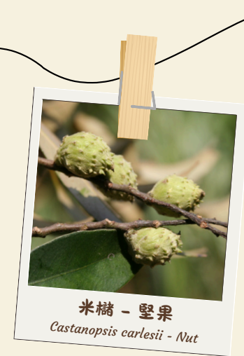
米槲 - 堅果 Castanopsis carlesii - Nut