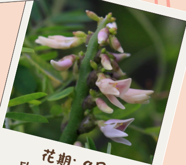
花期: 9月 Flowering Period: Sep