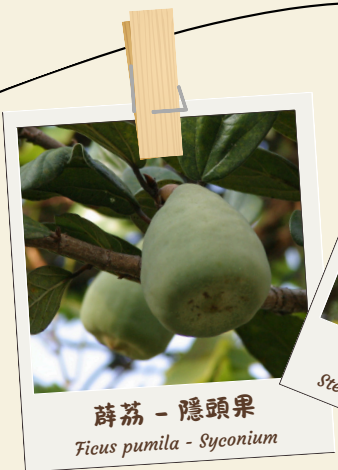
薜荔 - 隱頭果 Ficus pumila - Syconium