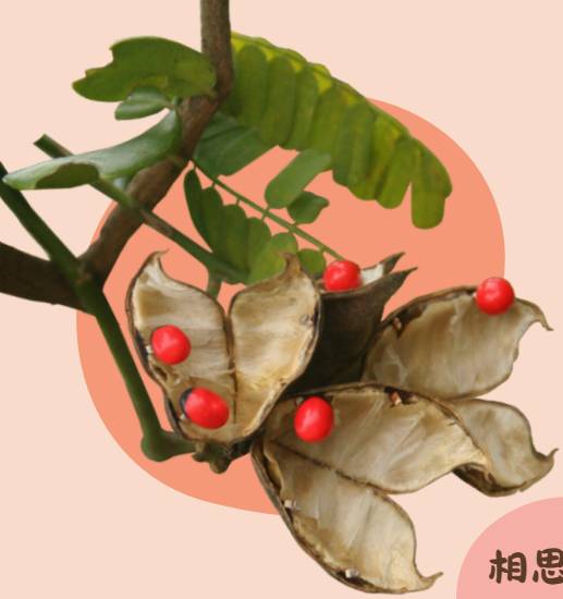
相思子 Abrus precatorius