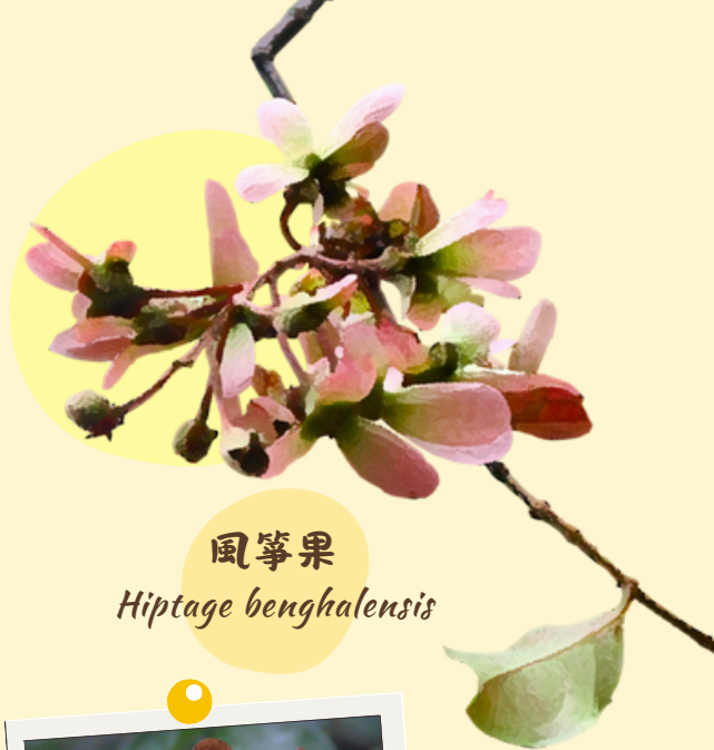
風箏果 Hiptage benghalensis