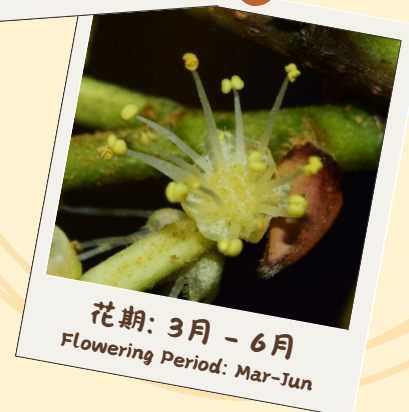
花期: 3月 - 6月 Flowering Period: Mar-Jun

米櫨的果屬於堅果(Nut)。堅果是乾果的一種，成熟時不會開裂，果皮堅硬和具一粒種子。