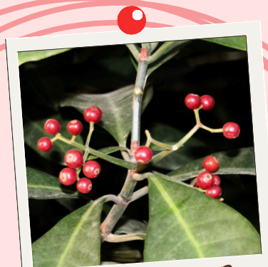
果期: 6月 - 翌年2月 Fruiting Period: Jun-Feb of the following year.