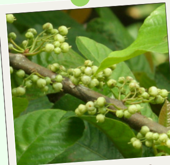
果期: 8月 - 12月 Fruiting Period: Aug-Dec