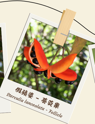
假蘋婆 - 蓇葖果 Sterculia lanceolata - Follicle