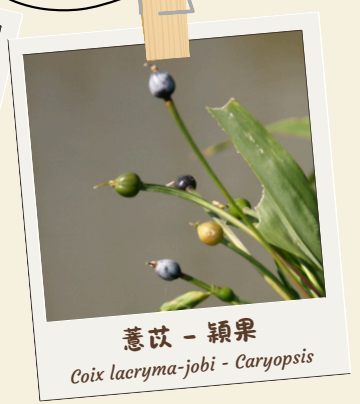
薏苡 - 穎果 Coix lacryma-jobi - Caryopsis