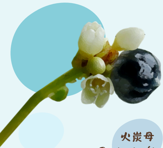
火炭母 Persicaria chinensis