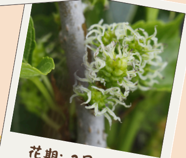
花期: 2月 - 8月 Flowering Period: Feb-Aug

桑的果屬於聚花果(Syncarp)。聚花果是由整個花序發育而成形成的複果，果實上每個小果都是由個別的花朵發育而成。