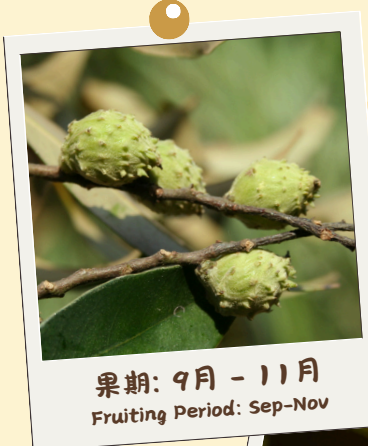
果期: 9月 - 11月 Fruiting Period: Sep-Nov