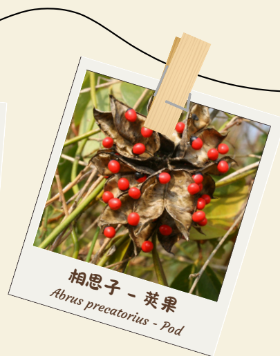
相思子 - 莢果 Abrus precatorius - Pod