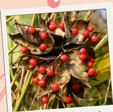
果期: 10月 - 12月 Fruiting Period: Oct-Dec