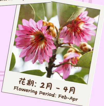
花期: 2月 - 4月 Flowering Period: Feb-Apr