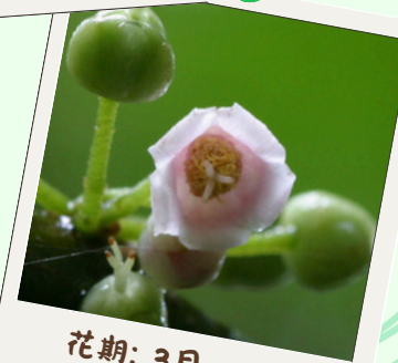
花期: 3月 - 7月 Flowering Period: Mar-Jul