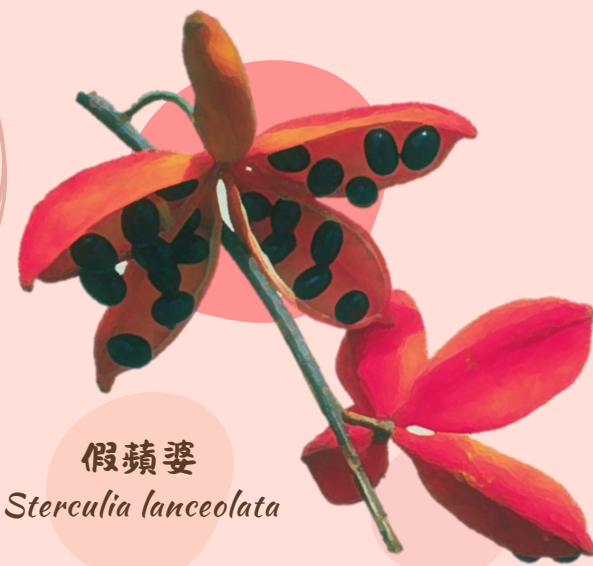
假蘋婆 Sterculia lanceolata