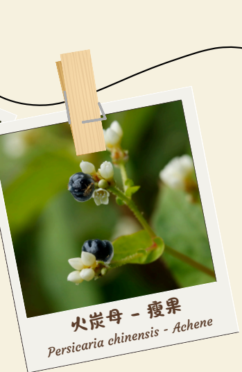
火炭母 - 瘦果 Persicaria chinensis - Achene