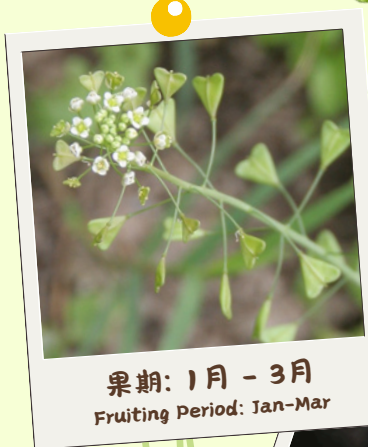
薺菜 Capsella bursa-pastoris