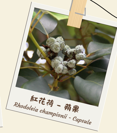
紅花荷 - 蒴果 Rhodoleia championii - Capsule