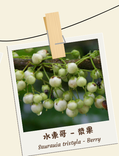
水東哥 - 漿果 Saurauia tristyla - Berry