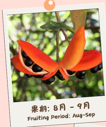
果期: 8月 - 9月 Fruiting Period: Aug-Sep