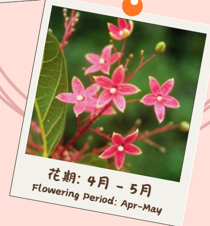
花期: 4月 - 5月 Flowering Period: Apr-May

假蘋婆的果屬於蓇葖果(Follicle)。蓇葖果是乾果的一種，由單一心皮形成，成熟時會沿腹縫線開裂。