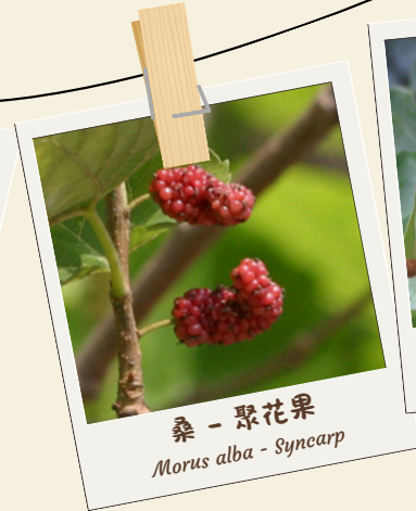
桑 - 聚花果 Morus alba - Syncarp