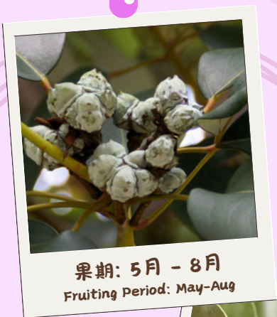
果期: 5月 - 8月 Fruiting Period: May-Aug