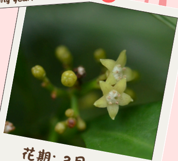
花期: 3月 - 9月 Flowering Period: Mar-Sep

九節的果屬於核果(Drupe)。核果是肉質果的一種，成熟時不會開裂，種子被堅硬的內果皮包裹。 The fruit of Psychotria asiatica is a drupe, a type of fleshy fruit. Drupe does not split open when mature, and the seed is enclosed in a stony endocarp.