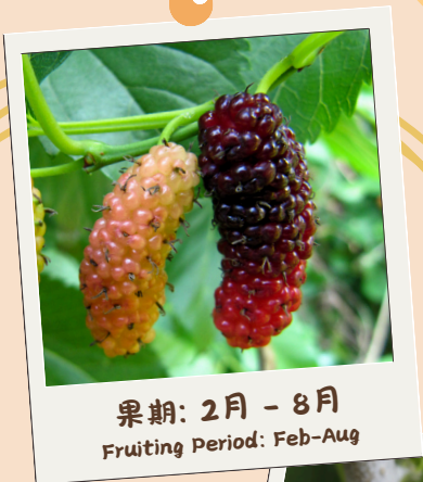
果期: 2月 - 8月 Fruiting Period: Feb-Aug