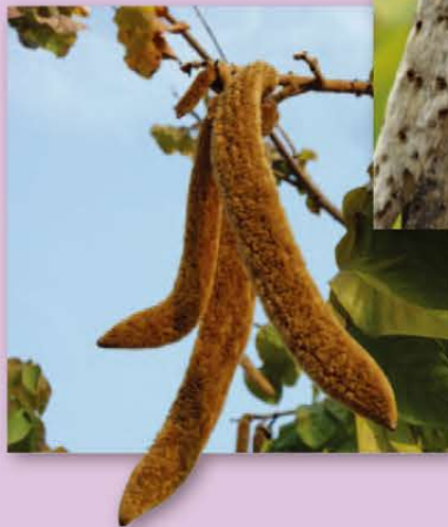
▲ 密被絨毛的貓尾木果實，好像貓尾 Capsules of Cat-tail Tree are densely covered by hairs, like cat tails