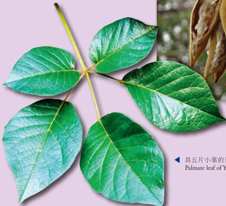
▲ 具五片小葉的黃鐘木掌狀複葉 Palmate leaf of Yellow Pui has 5 leaflets