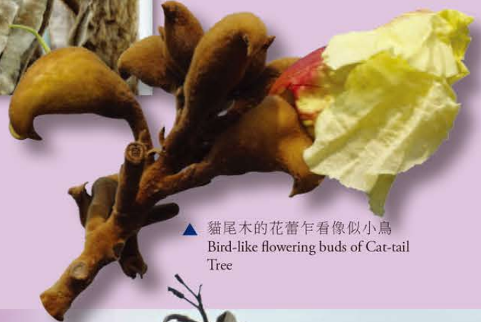
▲ 貓尾木的花蕾乍看像似小鳥 Bird-like flowering buds of Cat-tail Tree