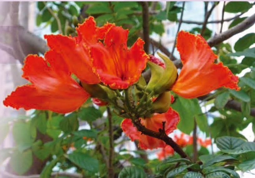
火焰樹的鮮紅色大花 Large bright red flowers of African Tulip Tree

African Tulip Tree is an evergreen tree native to Africa. It is often planted as a roadside tree. Large bright red flowers bloom at the top of canopy, which look like burning flame in distant. Hence, it is known as "Fire Tree" in Chinese.