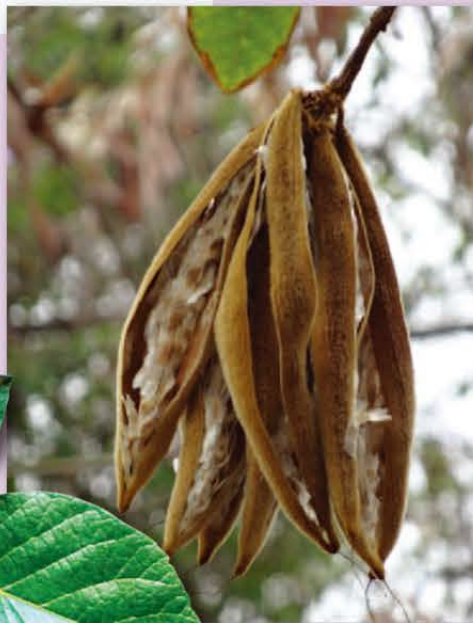
▲ 黃鐘木的蒴果被幼毛，種子具薄翅 Hairy capsules and winged seeds of Yellow Pui

Yellow Pui is a small deciduous tree introduced from South America. With large yellow spectacular flowers, it is often planted in parks and along roadsides for beautifying the environment. Unfortunately, Yellow Pui has very short flowering period, usually only lasts for about one week. In recent years, other Tabebuia species has been planted, such as the Silver Trumpet Tree ( Tabebuia argentea ), Pink Trumpet Tree ( Tabebuia impetiginosa ) and Rosy Trumpet Tree or Red Pui ( Tabebuia pentaphylla ). Owing to their colorful and showy flowers, these species have high ornamental value.