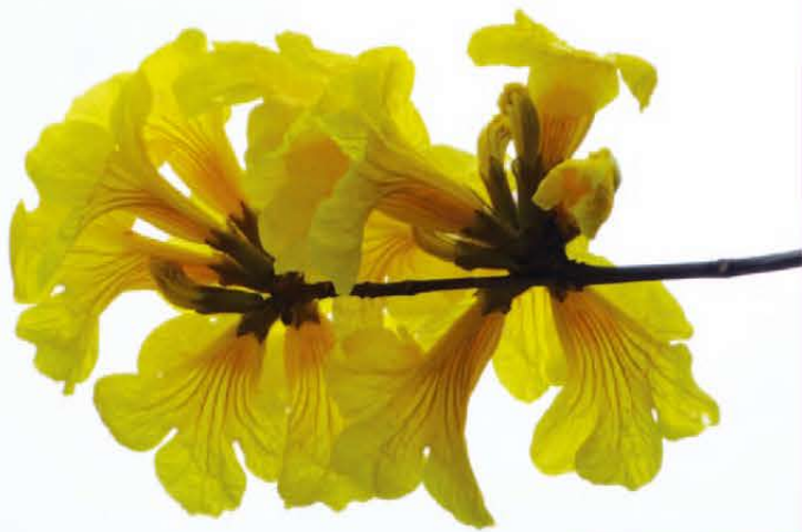
▲ 黃鐘木的鮮黃色大花 Large bright yellow flowers of Yellow Pui