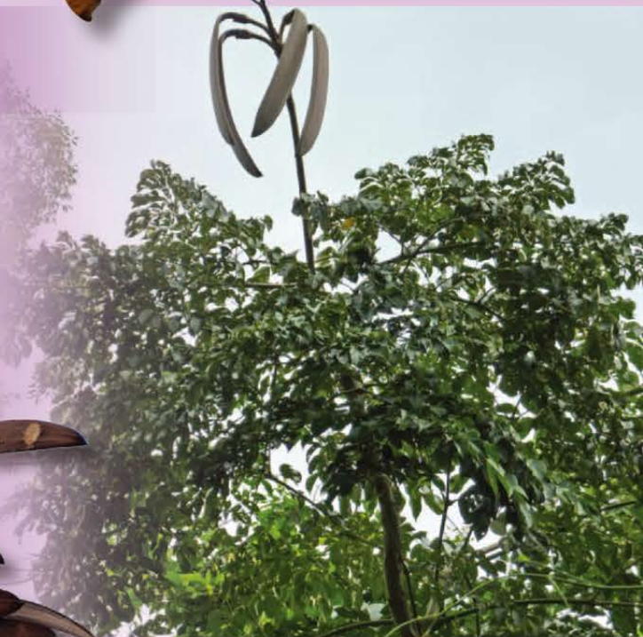
▲ 木蝴蝶的羽狀複葉 Pinnate leaves of Tree of Damocles