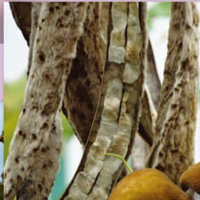
▲ 具薄翅的貓尾木種子 Seeds of Cat-tail Tree are winged