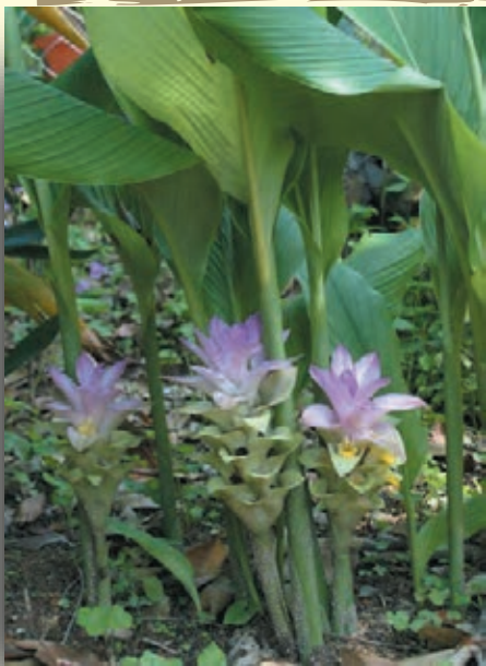
郁金(鬱金) Curcuma aromatica

The Ginger Lily, with white and fragrant blossoms, is one of the best-loved cut flowers in Hong Kong. While the Ginger is well known to every family for its rhizome which is a popular condiment for cooking Chinese dishes and the traditional medicine.